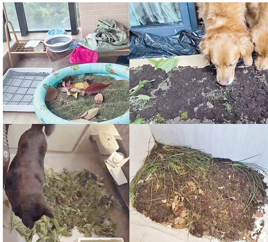
Pet owners have come up with creative ways to help their dogs do their business at home comfortably during lockdown.